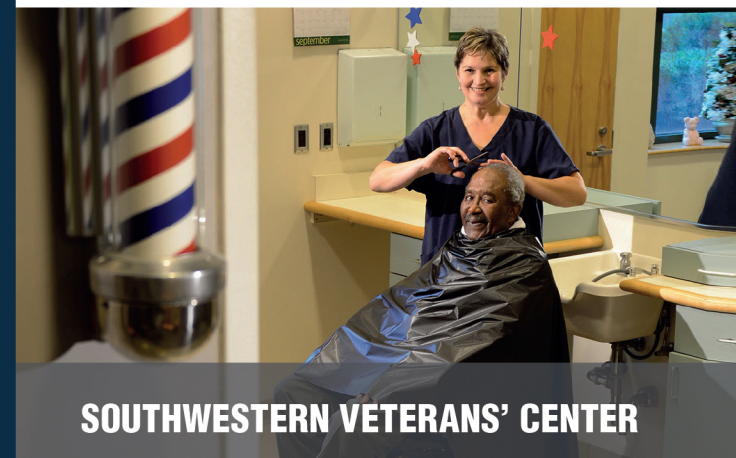
SOUTHWESTERN VETERANS' CENTER

DMVA Office of Veterans Affairs Bureau of Veterans Homes Bldg. 0-47 Fort Indiantown Gap Annville, PA 17003-5002