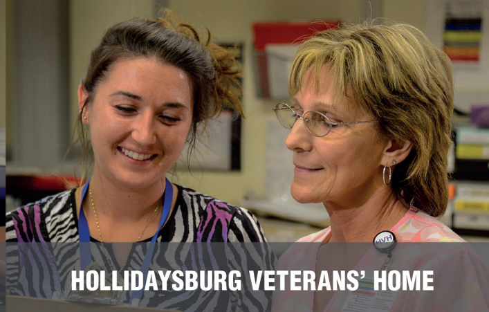
HOLLIDAYSBURG VETERANS' HOME