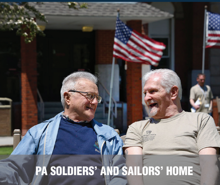
PA SOLDIERS' AND SAILORS' HOME