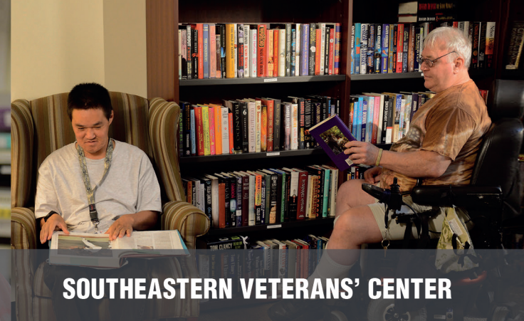
SOUTHEASTERN VETERANS' CENTER