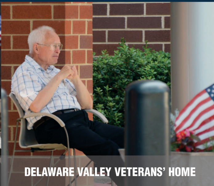
DELAWARE VALLEY VETERANS' HOME