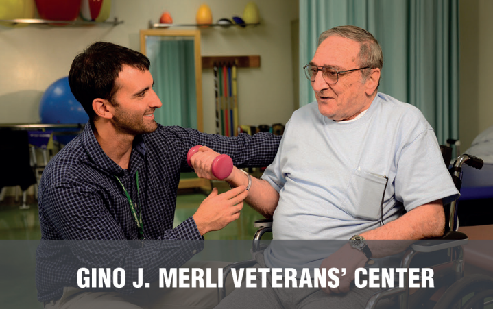
GINO J. MERLI VETERANS' CENTER